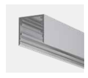
profile (anodised alu) N68230