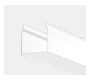
opal/ high N68249