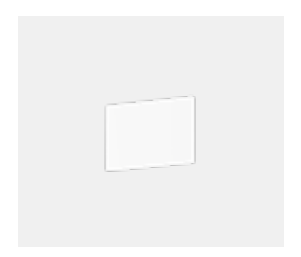
end piece opal U-cover (1x) N68250