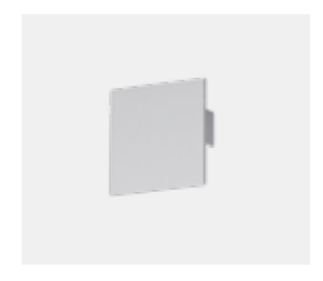
end piece grey (1x) N68232