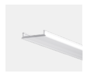
opal/ flat N68228