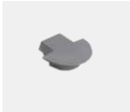
end piece grey (1x) PL1430