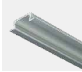
alu profile PLB3775/1