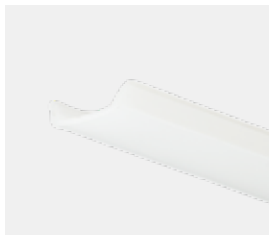
opal/ flat PL1547/1